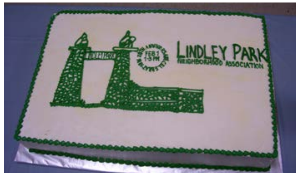
The LPNA celebrates 20 years and let's them eat cake.