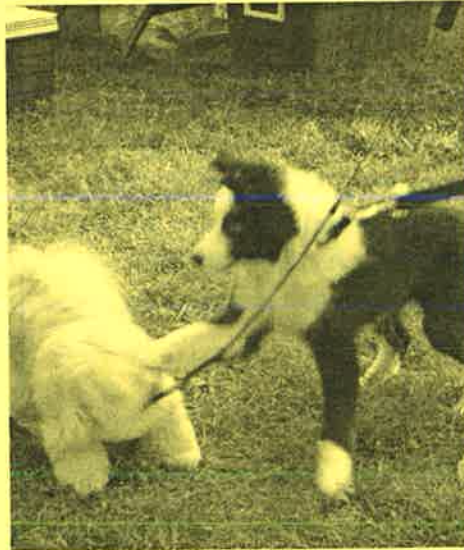
Dogs and kids seemed to enjoy the night out!