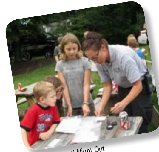
2013 National Night Out