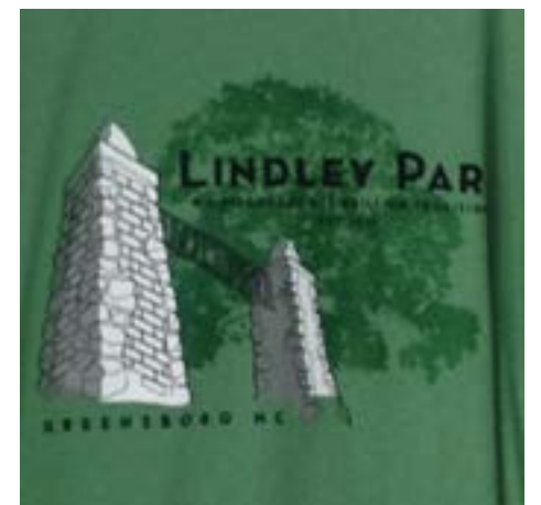
Lindley Park t-shirts from page 5