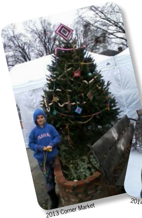
2013 Corner Market

See more photos on pages 3, 5, 6, 7, 9, 10, and 11