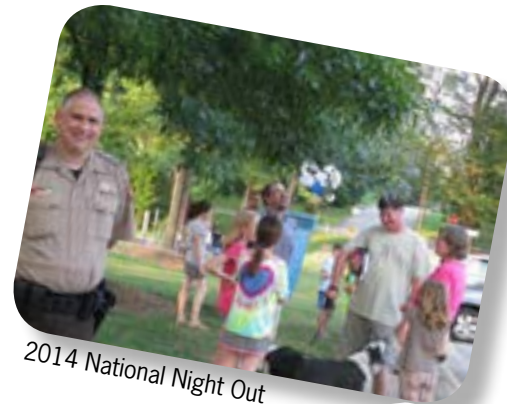
2014 National Night Out