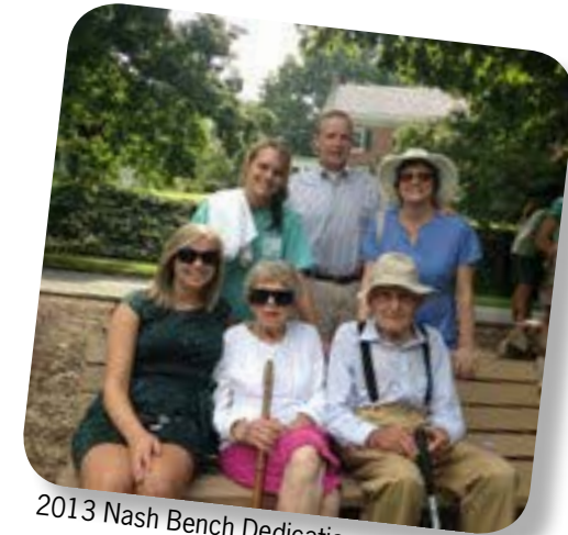
2013 Nash Bench Dedication

Look for the new recycling education materials in postcards mailed to residents, on billboards and City trucks, on the City's website, on GTN ads and videos, and ads on local television stations. To learn whether or not an item is recyclable, call the City's Contact Center at 373-CITY (2489), visit www.greensboro-nc.gov/recycle or email recycle@greensboro-nc.gov .