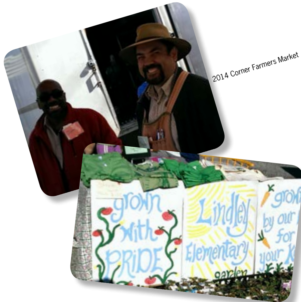
2014 Corner Farmers Market