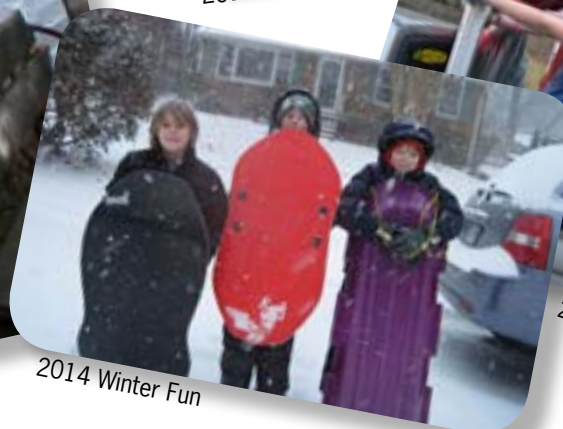
2014 Winter Fun