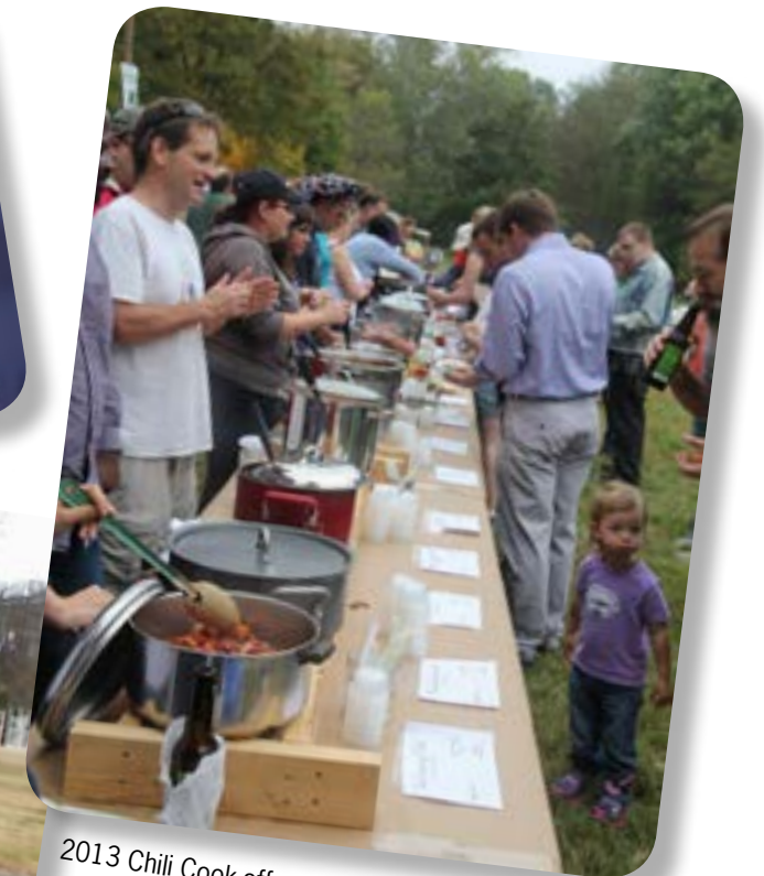
2013 Chili Cook-off