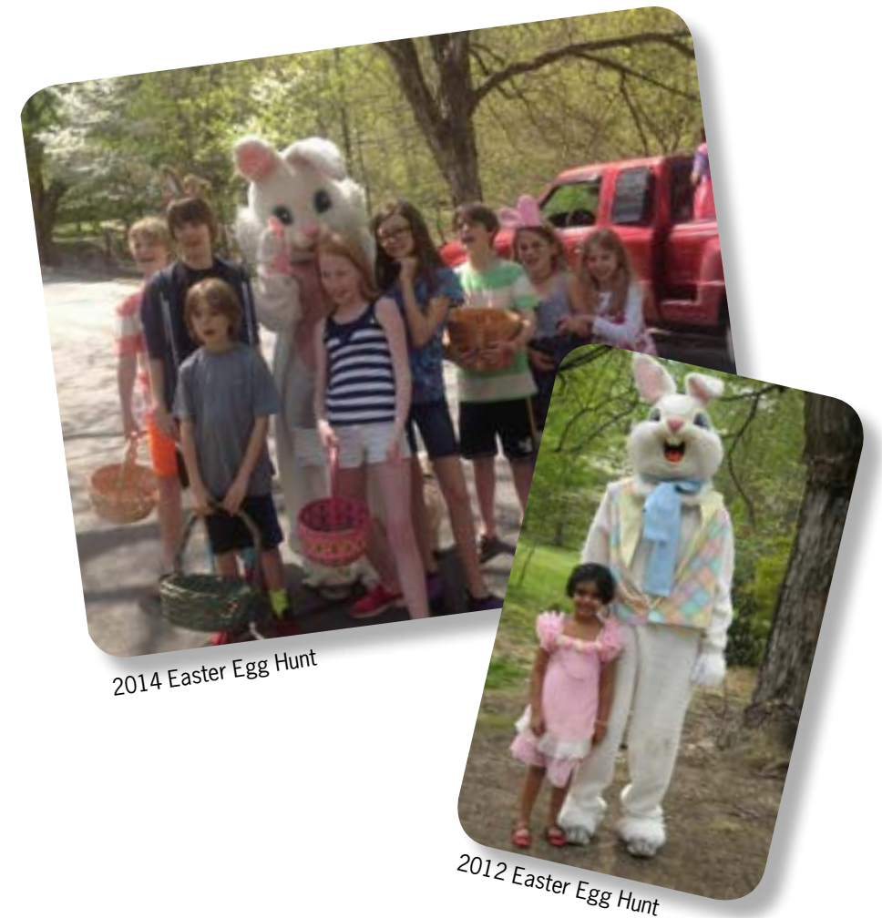
2014 Easter Egg Hunt