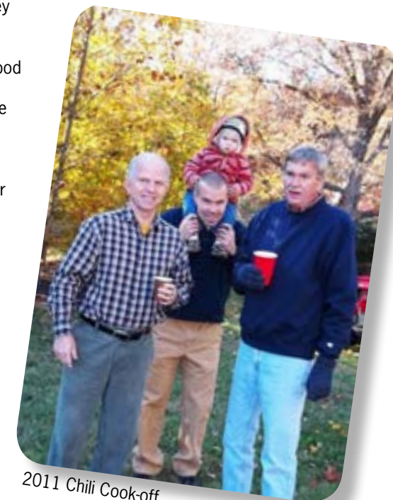
2011 Chili Cook-off