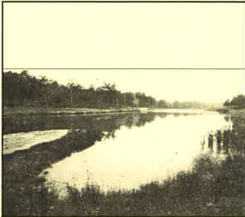
Lake at Lindley Park - possible location is area between Lindell, Willowbrook and Park Terrace.