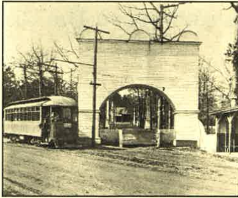
Lindley Park Arch - possible location - Masonic & Spring Garden Sts.

While some locations are easy to figure out, others like the Arch, the Lake and the Amusement Park are educated guesses.