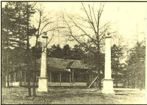
Lindley Amusement Park - possible location - Masonic Dr.