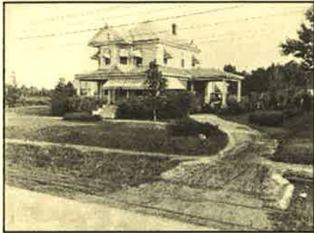
Paul Lindley House 2408 Spring Garden St.