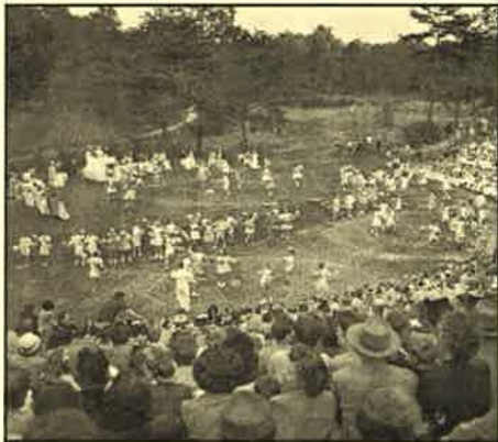
Lindley Elementary School Ampitheater, May 1946