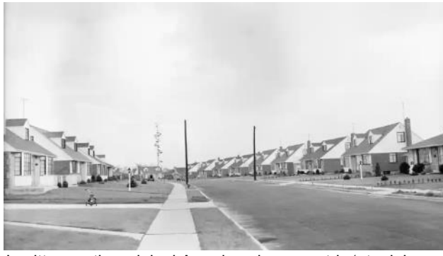
Levittown - the original American lawn-centric 'utopia'

This moved in the direction of a grass monoculture with the development of fertilizers and often toxic weed-killing chemicals. Clover had previously been accepted in lawns and is